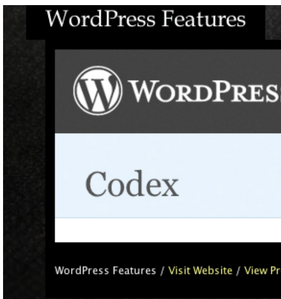
Image for your portfolio: You will need a 600x200 image for you every portfolio item you have. This could be a screen shot of the portfolio item. Upload it using Wordpress and get the link url and paste it in on the value column. For key, type in portfolioItem (make sure to type it in exactly because it is case sensitive )and then press add custom field. Next time you do this again you don't need to type portfolioItem again just select it from the drop down list.

Now this is where it gets interesting. Under advanced options click on custom fields. There is 3 things you need, the image for portfolio, the thumbnail for your portfolio, and url address for your portfolio.